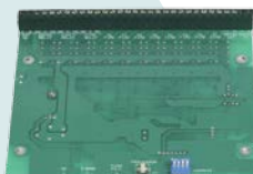
Part No. K580