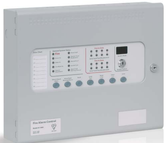
Model No. K11080M2