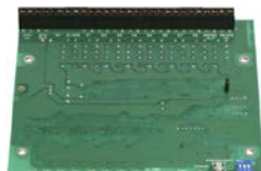
Part No. K461