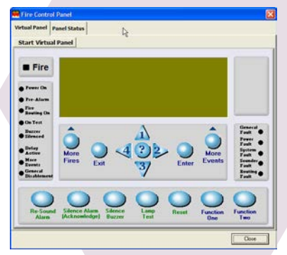
Virtual Panel - allows direct control